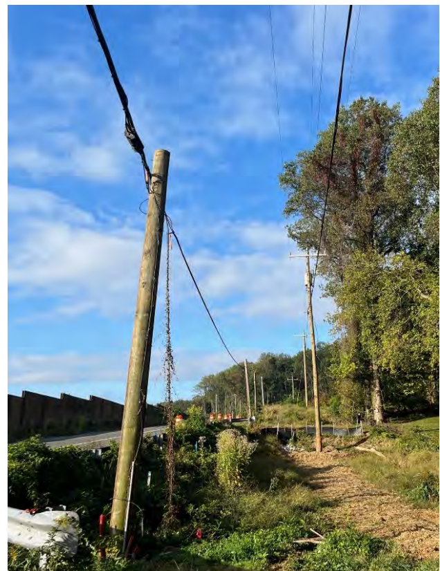
Dominion Energy will transfer electrical power from the old power line (left) to the new power line (right).

Dominion Energy and the 495 NEXT project team regret any inconvenience caused by the unavoidable interruption of service.