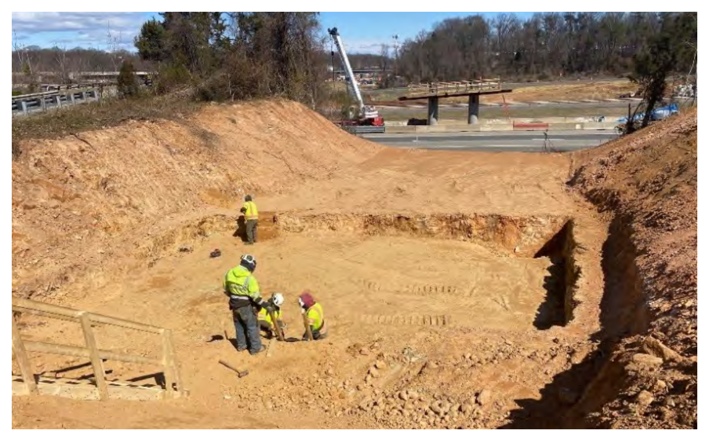
Workers prepare the site for pile driving at the southern landing of a new bridge over Dulles Toll Road. Starting in late March, a total of about 26 steel piles will be driven at this location, followed by a similar number of piles driven on the opposite side of the Dulles Toll Road, farther away from the Gates of McLean. The under-construction center pier of the new bridge is visible in the distance.

To learn about various features of the 495 NEXT project near the Gates of McLean area, residents are invited to use an interactive map on <u>495NEXT.org</u>. Visitors can enter their addresses and use the field-chooser to view their residences in relation to the locations of existing and new ramps, noise walls, the future, widened Beltway, and other project features.