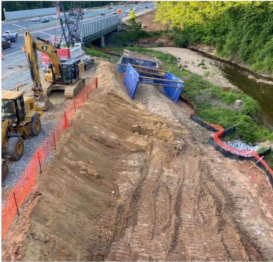
Looking down from the existing Old Dominion Drive Bridge, steel piles will be driven into the earth at this location between Scott's Run and the Capital Beltway for a new bridge.