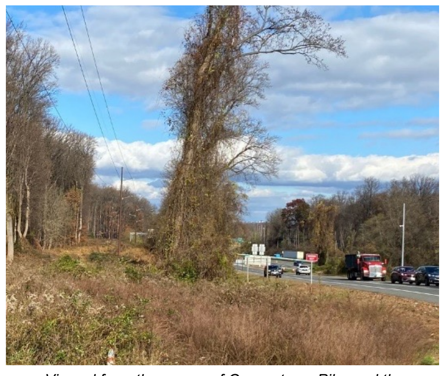
Viewed from the corner of Georgetown Pike and the existing off-ramp, this narrow area of Scott's Run Nature Preserve to the right of the overhead powerlines is where clearing occurred for the 495 NEXT project.